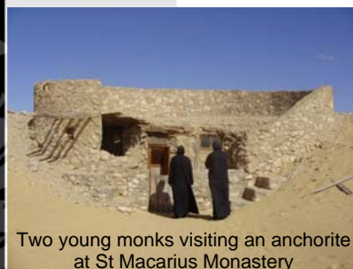
Two young monks visiting an anchorite at St Macarius Monastery

The Apophthegmata Patrum is an extraordinary anthology. In its pages, one finds "a diverse band of colorful characters, wild adventures, and stinging, memorable 'one-liners.'" Its publication marked an important milestone in the literature of late antiquity. As Peter Brown has noted, "The Sayings provided a remarkable new literary genre, close to the world of parable