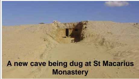
A new cave being dug at St Macarius Monastery

they do not give an accurate picture of the contemporary monastic life in Egypt. There are two contributing factors to this distorted picture, the first being that when western writers go to Egypt they are limited in their interviews to anchorites who speak western language i.e. French, English and German, which only represent a very small percentage of monks living this style of monasticism.