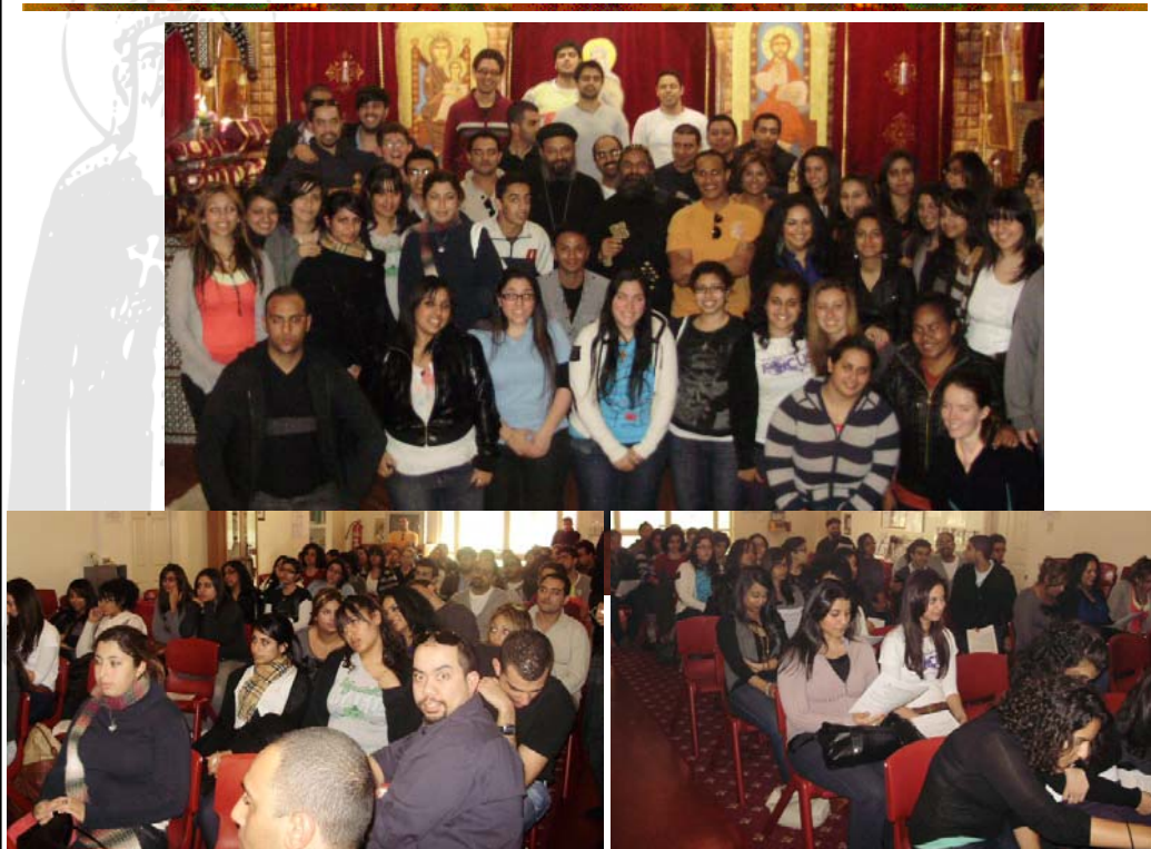
A group of youth from all Universities spending a spiritual day at the Monastery

(From: Otto F.A. Meinardus. “Monks and Monasteries of the Egyptian Deserts.” )