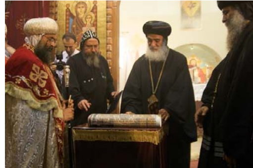
The Papal delegates signing the document of Investiture